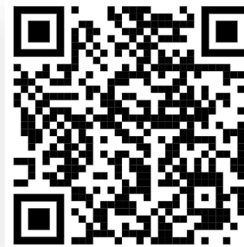
Brian Cornblatt BioHarvest