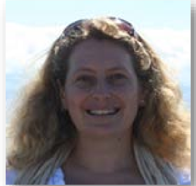
Marelize Gorgens The World Bank ~11:00 – 11:20