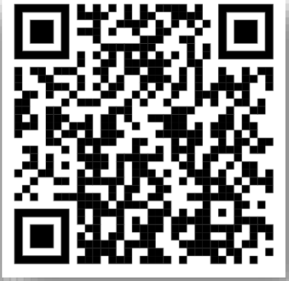
Steve Winston Transcending Incrementalism ~9:40 – 10:00